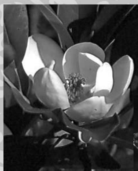
Sweet Bay Magnolia